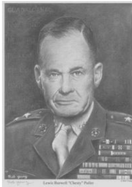
Lt. Gen. Lewis “Chesty” Puller