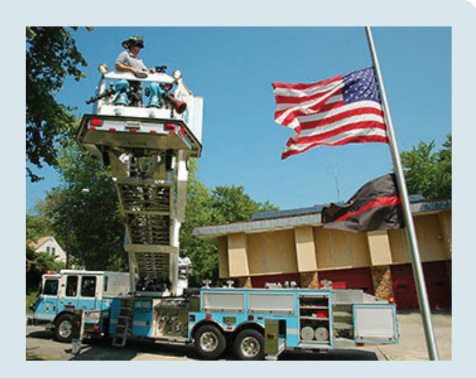
Town of Chapel Hill Fire Station #1 solar PV panels and biodiesel fire truck.

Solar Bus Stop. Thanks to a 2007 donation by what was then called the Million Solar Roofs Committee, a bus stop on Franklin Street was outfitted with a 165-watt solar