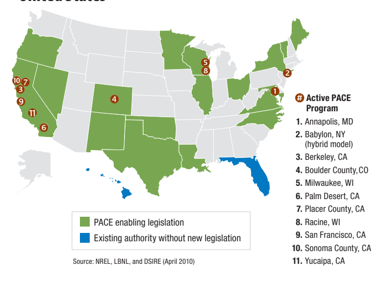
Figure 2. PACE legislation and programs in the United States

The interagency working group responsible for the report recommended providing program guidance to local government financing programs to address the financing barrier. The U.S. Department of Energy is also supporting PACE financing programs through technical assistance, webinars, and online resources for American Recovery and Reinvestment Act grantees that are pursuing long-term financing mechanisms for energy retrofits.<sup>5</sup>