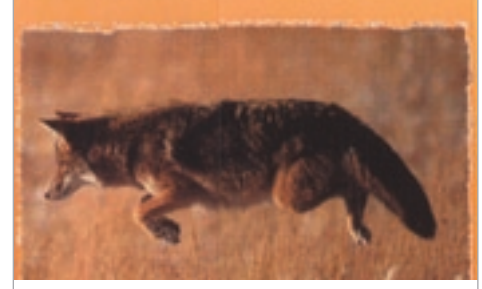
Published information and signs are used by the Stanley Park Ecology Society to inform citizens about coyotes.

Vancouver in the late 1980's and have been seen regularly around Queen Elizabeth, Everett Crowley and Stanley Park, UBC, Trout Lake and on local golf courses. They can however, be found in any neighbourhood - including yourn! Report your coyote sighting to 604 681 9453.