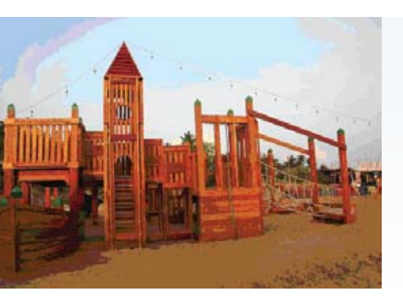
The final design of the playground in Nagapattinam was based in part on drawings that schoolchildren made of an "ideal" play space.

a flood mitigation pilot project was completed in Nagapattinam. Ponds and water bodies were cleaned and linked together through the widening of seven ponds to allow for a free flow of water during storm surges and to provide a natural system for draining water that accumulated as a result of inclement weather.