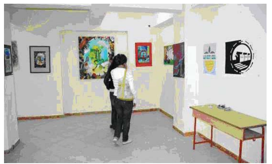
The poster art exhibition for the Clean-up and Pilot Recycling Day event.

Four cleaning and recycling teams worked with shovels, brooms, and scrapers to clean and pick up recy-