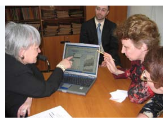
Staff from Bolshoy Kamen explain their municipal budget to partners from Kenai, Alaska.

This incubator will leverage the already active business plan training at the Institute of Economics and Technology. The incubator will provide assistance and training to potential new businesses in the areas of marketing, accounting, permitting, and management. It will allow businesses without access to credit to establish themselves at minimal cost, as the institute and the city will provide basic services and building space as well as training and support.