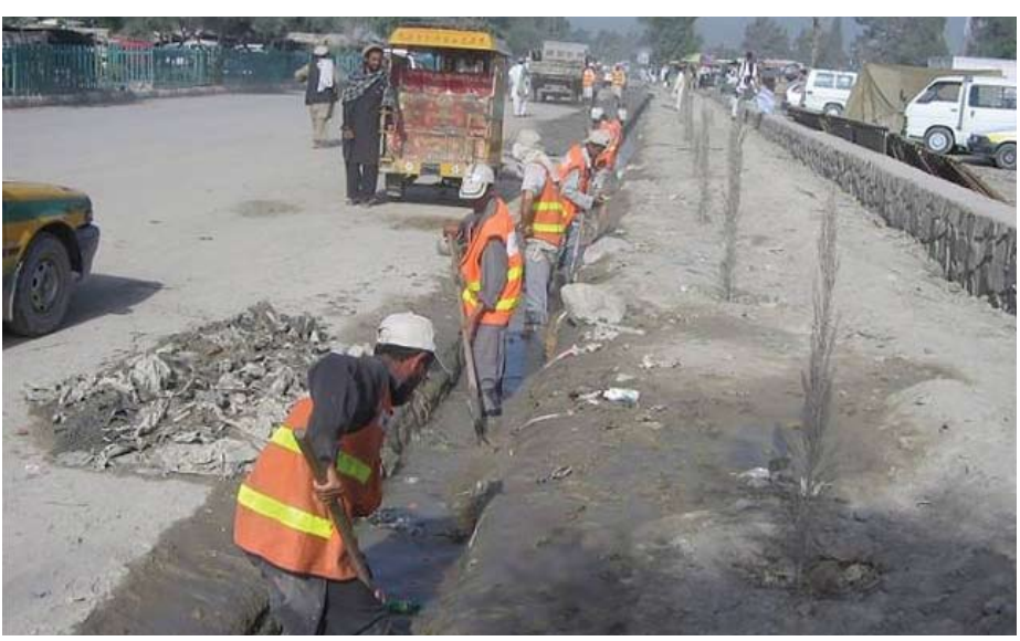
Workers in Kabul were employed to clean street-side drainage ditches of debris and sewage to improve the flow of water and remove a public health hazard.

The ditch clearing was planned in conjunction with trash collection. Clearing the ditches required workers