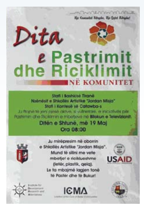
A poster for the Clean-up and Pilot Recycling Day event.

development issues and review of the private contractors' 2007 contracts with the city. It was based on New York City's Scorecard Program, which was managed by the mayor's office, to monitor street cleanliness and citizens' awareness about the issues.