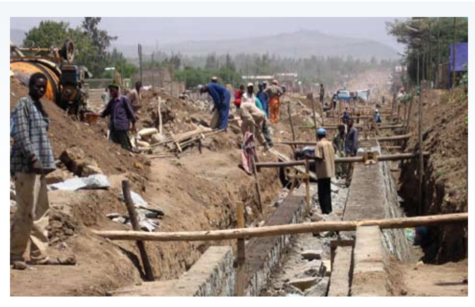
Roads and other new infrastructure help promote economic development in Adama.