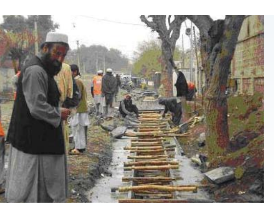
Workers in Jalalabad make improvements in a ditch that is part of the city's sewage system.

the desired activities, but to serve as "change agents" with the municipal staff. A typical AMSP augmentation team in a municipality might include the following positions/functions: