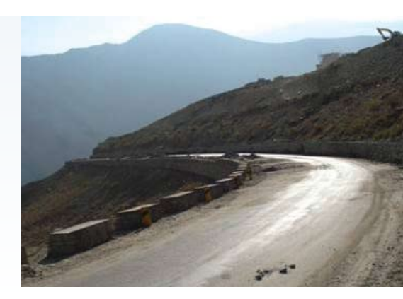
Near Bazarak, the capital of Panjshir province, the CityLinks team eliminated a significant roadway hazard by building this safety wall at a dangerous curve along an important transportation route.

The lack of trained and competent municipal staff proved to be a constant in all municipalities. Accordingly, as part of the MOU process, the mayor worked with the AMSP staff to identify areas in which AMSP staff members would augment the existing municipal staff. These AMSP employees work in the municipal facilities not only to implement