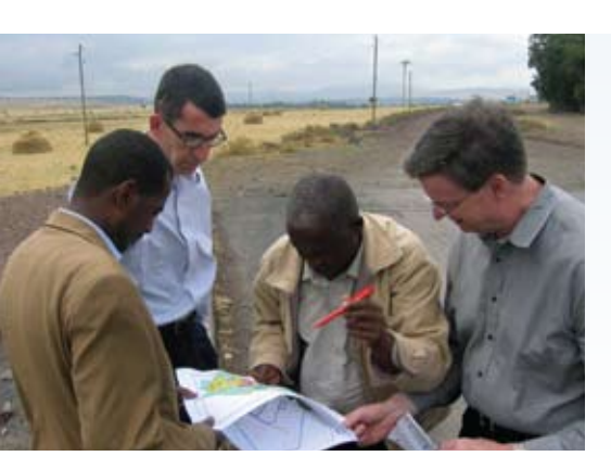
Adama city staff meet with pro bono professionals from the partner city of Portland, Oregon, to plan a new industrial district.

to developing LED policies for the municipality, establishing public-private partnerships and other forms of synergy with the private sector, and implementing a long-term vision for increasing Adama's competitive advantages and future economic growth.