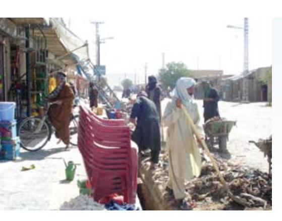
Trash removal was one of the small infrastructure projects the CityLinks program initiated to improve the quality of life in Kabul.