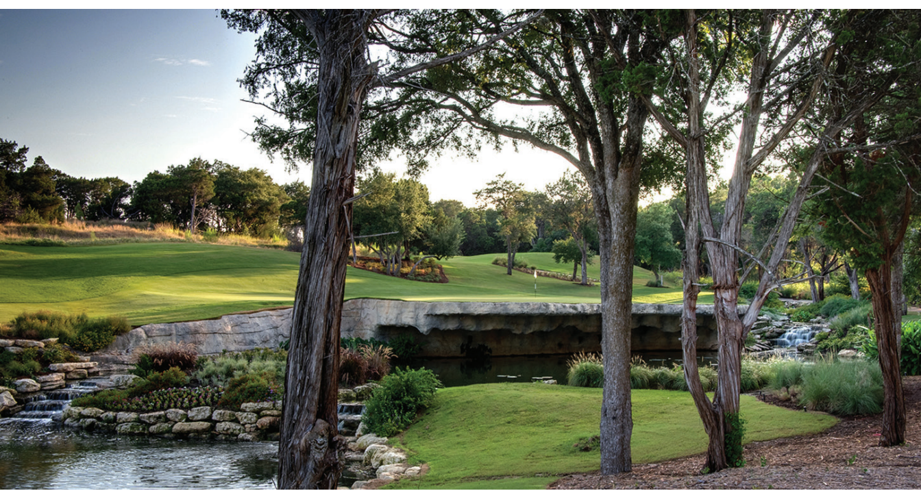
Falconhead Golf Course